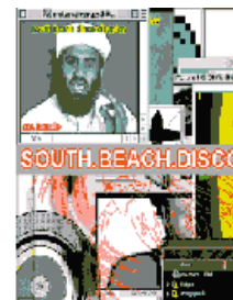
south beach disco by antonio mendoza